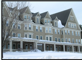
Silver Bay Association

Here in Hague you will find a resort area that is non-commercialized, uncrowded and unspoiled, with many resorts having private sand beaches that are among the finest on Lake George. Hague maintains its own Town Park including swimming facilities and boat launching site. Gently rolling hills and mountains provide a fitting backdrop to the azure-blue "Queen of American Lakes".